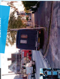
cars parking right up to the junctions on the pavement, reducing visibility for cars pulling out or turning into side roads