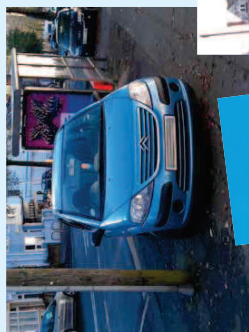
cars driving along the pavement