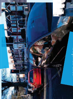
cars causing obstructions by parking next to pedestrian dropped kerbs and bus stops